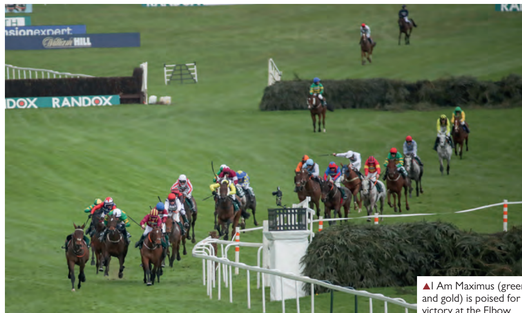
▲ I Am Maximus (green and gold) is poised for victory at the Elbow